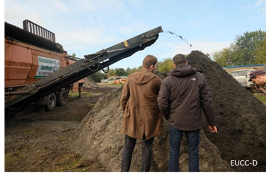
Beach wrack storage facility (left) and beach wrack treatment operations (right) Island of Poel (DE)

Like for many other coastal communities, it is economics that has the main consideration where beach wrack management is concerned on the Island of Poel. Since it is classified as waste, beach wrack at the moment has no economic value at the point of beach collection. The value of beach wrack removal lies in the provision of ,cleaned‘ recreational beach space and the tourist activities on the Island that depend on it being attractive for visitors. However, the relationship that the municipality has built up with the local fertilizer company does bring some added value to beach wrack removal. Even though the community pays extra to be rid of the material, it does so in the knowledge that it will be treated and used in a worthwhile and environmentally friendly manner.