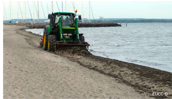
Beach wrack landing (left) and beach wrack removal operations (right) on Timmendorfer Strand, Island of Poel (DE)

Tourism plays an essential role on the Island of Poel and is the most important employer. Two main tourist beaches on Poel are Timmendorf Strand and Schwarzer Busch. Both are sandy and popular with tourists in the summer months. Both these main tourist beaches (approximately 3km out of a total 9km beach length on the island) are mechanically cleaned daily during the tourist season. With respect to the size of beach wrack landings on the main tourist beaches, the local Spa Manager regards a small monthly amount of beach wrack as being 100 tonnes per month, medium amount is 300 tonnes, large amount is 500 tonnes and an extreme event, could see amounts of 700 tonnes landing per month. In general, the local authority reports that beach wrack amounts have been increasing over the past 10 years. The municipality cooperates with a local fertilizer company Hanseatische Umwelt GmbH which is paid to periodically come and collect stored beach wrack (CONTRA, Management Questionnaire, 2019).