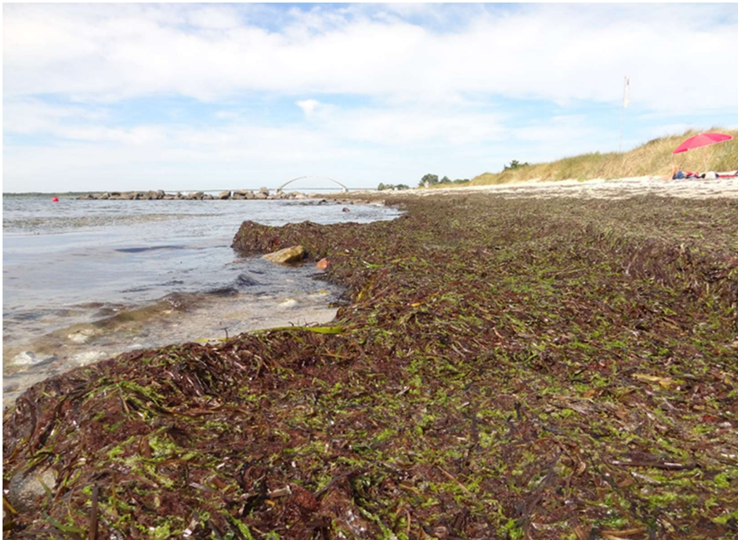
Large beach wrack quantities on Island of Fehmarn (DE)

the outset that socioeconomic and environmental factors are in conflict at every case site, but it seems that pathways to resolve these conflicts are not being considered. The sheer complexity of the factors at play makes balancing stakeholder interests very difficult even in the short- and mid-term. This report is an important first step in establishing and increasing awareness of stakeholder opinions on the topic of beach wrack, however further research is required to develop any guidelines on a local level that beach managers can refer to while considering all relevant specificities of their beaches.