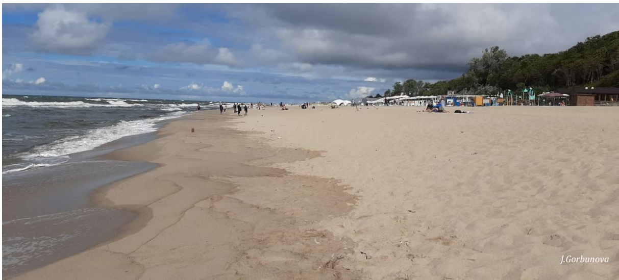
Yantarny beach, Kaliningrad (RU)

The development strategy of the Yantarny urban district defines tourism as one of the leading industries. This is associated with the development of another leading industry, namely amber trading.