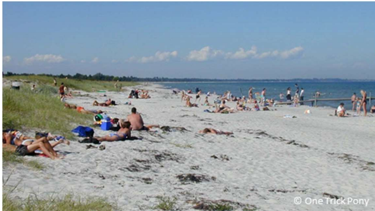
Patchy beach wrack on tourist beach in Municipality of Køge Denmark (DK)

on when during the year levels are high. Like for most other coastal municipalities there is a lack of local data to support the decision making process. The municipality also reports a lack of knowledge and clarity on the legal framework surrounding beach wrack management, particularly governing collection and storage. Information gathered from other DK municipalities has led to an understanding that actually, a permit (according to the environmental protection law paragraph 19) is required when storing it in piles. However, the lack of legal understanding means that many municipalities like Køge still go ahead and pile it up to decompose out of the main tourist beach area. Questions on local regulations need to be discussed with the Environmental Protection Agency.