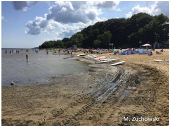
Location of public questionnaire (2019) on Puck City beach, Poland

including adjacent restaurants, rentals, sports equipment. The accumulation of marine waste generates a bad smell and this also negatively affects the number of people using beach related services.