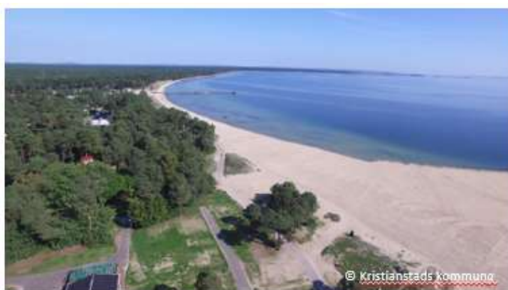
Tälletstranden, Åhus, Kristianstad, Sweden

The beach Tälletstranden is situated in the medieval town of Åhus, a small village within the municipality of Kristianstad in Skåne, southeast Sweden. Åhus is one of the best preserved medieval towns in all of Sweden. Today Åhus is an “absolute” dream setting for around 12,000 permanent residents and at least as many summer visitors. The main attractions are the long sandy beaches, the excellent visitors’ marina and the medieval town centre. Tälletstranden is also famous for hosting large beach soccer and beach handball sporting events. Tälletstranden is purposefully maintained with recreation in mind. It has the Blue Flag award and has a high value for the municipality. The total tourist economical revenue for the municipality is around 900 million Swedish Kronor, based on 2 million visitors every year. The municipality estimates that the beaches in Åhus stand for at least 20 % of that. But they also say that it is just an estimation.